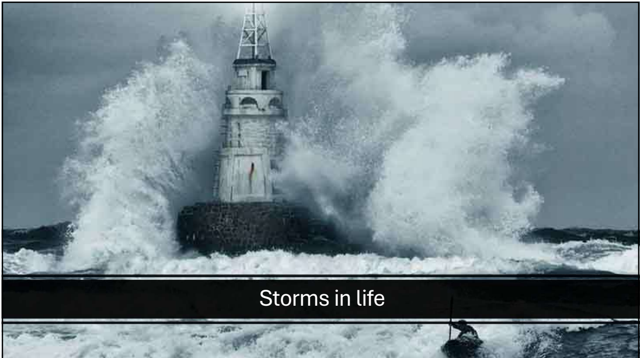
Storms in life